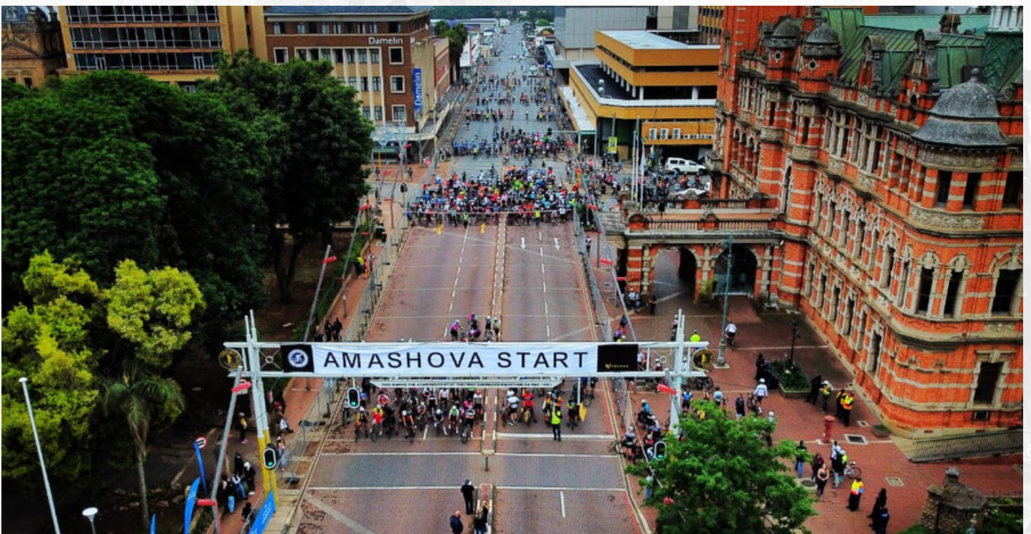
Amashova 2022 started at the City Hall where Mayor Thebolla was present to wish the racers the best of luck.